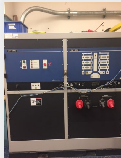
Power Cycling Station