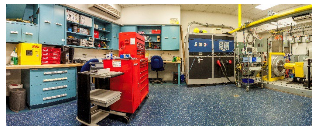
ECL & Cell 10