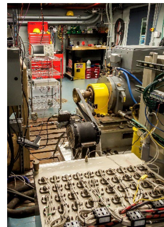
Niehoff Alternator 600VDC