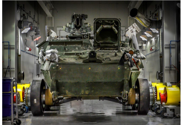
Wheeled Vehicle Performance Testing