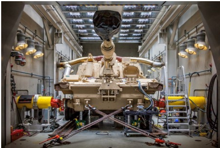
Tracked Vehicle Performance Testing