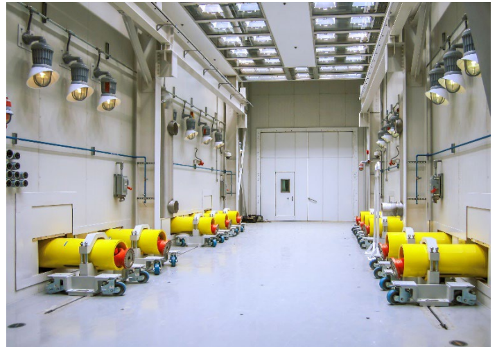
PEVEL - Test Cell Interior