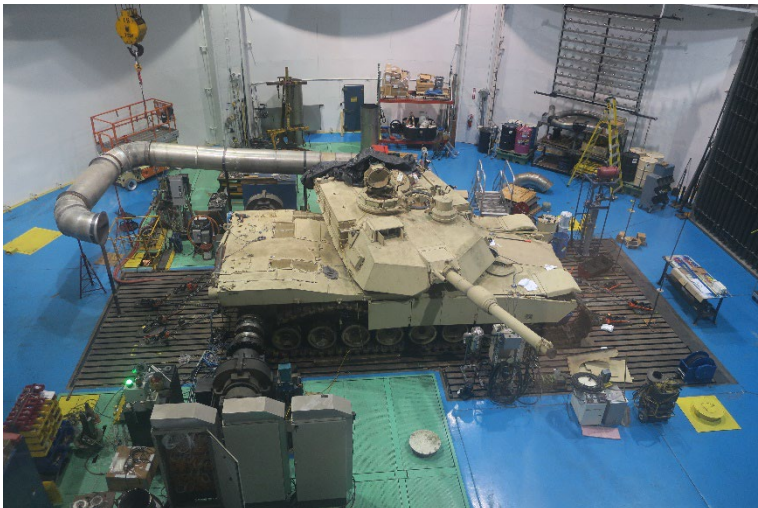
Tracked Vehicle Performance Testing