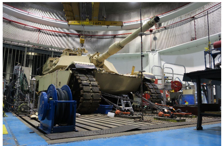
Wheeled Vehicle Performance Testing