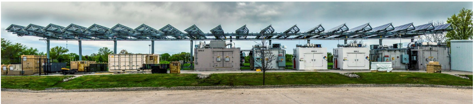
Outdoor Pack Test Chambers